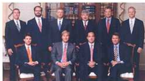
Pierce, Hems, Sloan and McLeod, LLC